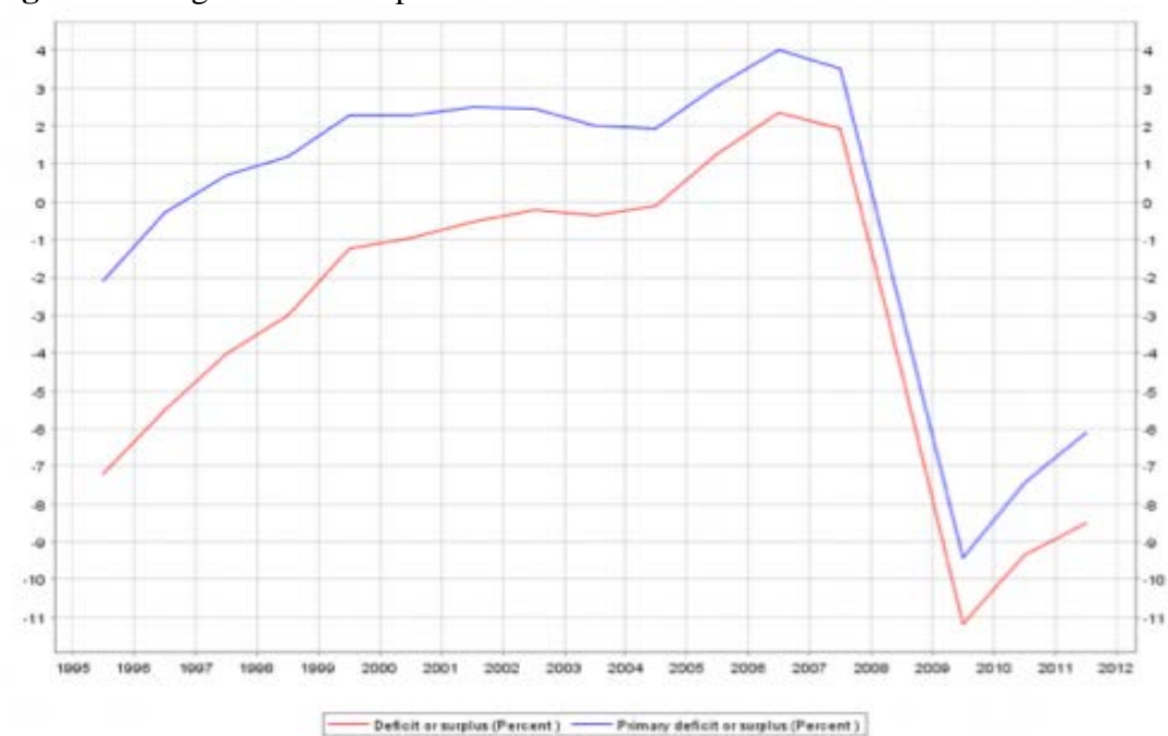
Figure 3. Budget deficit in Spain